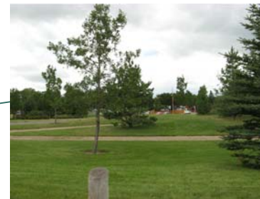
Harold Tatler Park North