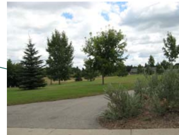
Harold Tatler Park South